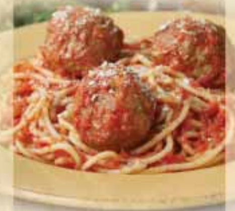
Spaghetti with Meatballs

Served with pita bread & a Greek salad 7.99