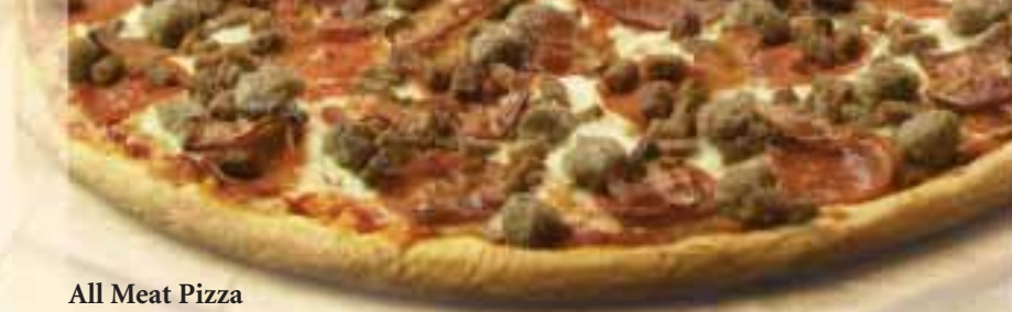
All Meat Pizza