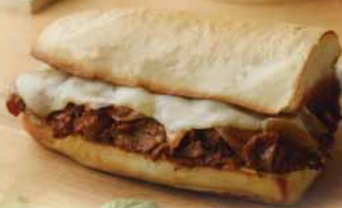
Steak & Cheese