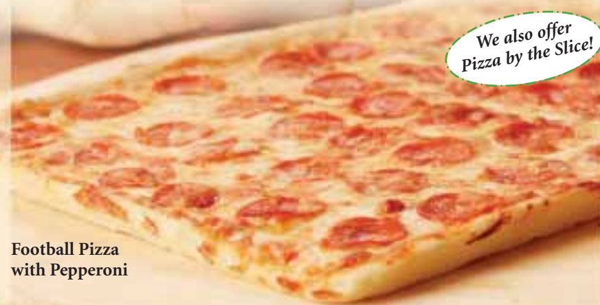
Football Pizza with Pepperoni